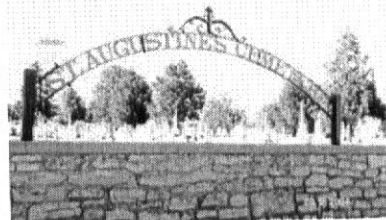
Cemetery Photo Added by: LKlaer