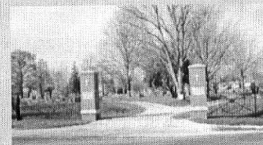
Cemetery Photo Added by: Joan Frey